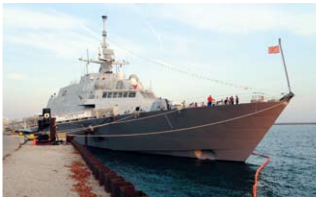
FIRST OF TYPE On 8 November 2008, the Freedom (LCS-1) was commissioned at Milwaukee, Wisconsin. She is the first of two different prototypes for littoral combat ships.

In the case of the Coast Guard, ships are placed in full commission after they reach their homeports.