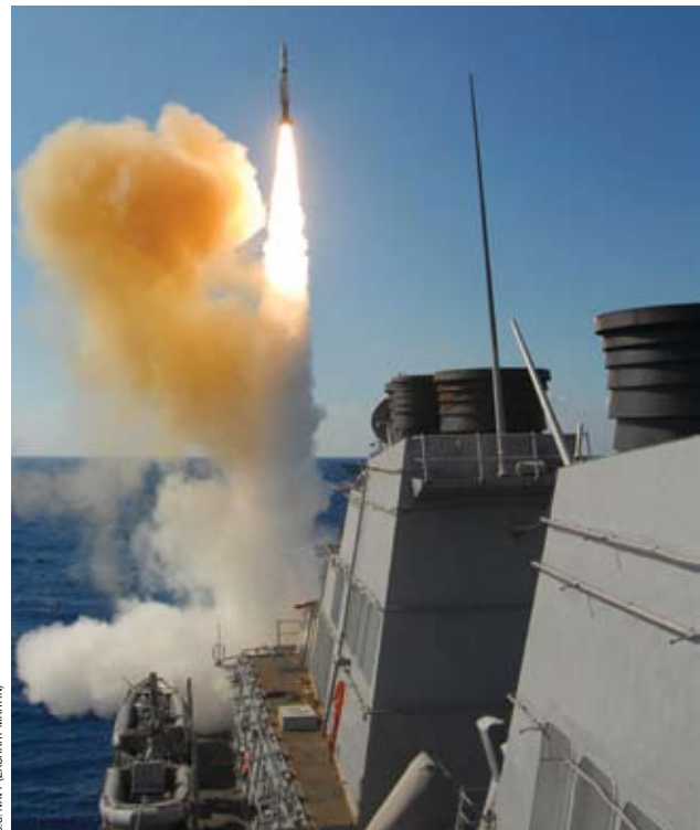
SHIP TO SHIP An SM-2 Standard Missile is launched 6 October 2008 from the USS Stout (DDG-55) during a sinking exercise. The target was the ex-USS O'Bannon (DD-987).