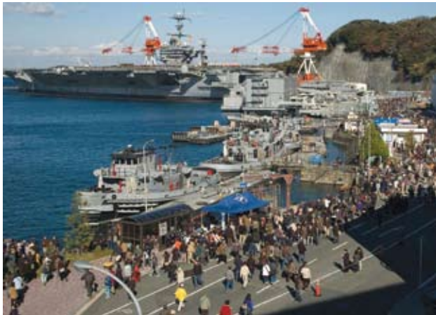
READY TO VISIT Visitors in Yokosuka, Japan, lined up for hours to take tours of the USS George Washington (CVN-73) in December 2008. It was the first opportunity the ship had to welcome the public since she arrived in the port as replacement for the Kitty Hawk (CV-63).