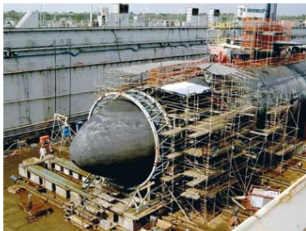
TEMPORARY NEW BOW The USS San Francisco (SSN-711) is pictured in Apra Harbor, Guam, after receiving a temporary bow in May 2005. Repairs, including grafting the bow of the decommissioned Honolulu (SSN-718) onto the submarine, should be completed in 2009.