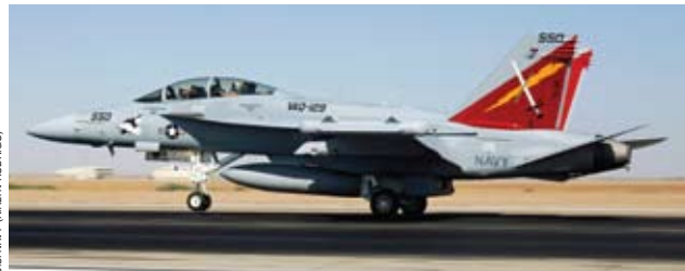
NEW BIRD TAKES FLIGHT On 3 June 2008, VAQ-129 received the fourth production EA-18G at NAS Whidbey Island, Washington. At El Centro, California, later in the year, one of the squadron’s Growler’s takes off on a training mission.

1. VFA-211 has never been officially classified as a VFA by an OPNAVNOTICE 3111. Officially—on paper—it is a VF squadron, but in reality is employed as a VFA and flies F/A-18F aircraft.