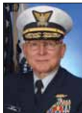
Robert J. Papp Jr. Commandant 1