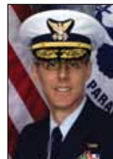
Peter V. Neffenger Deputy National Incident Com- mander for the Deepwater Horizon response 29