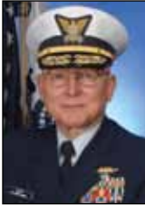
Robert J. Papp Jr. Commandant 1