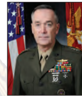
Joseph F. Dunford