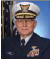
Robert J. Papp Jr.