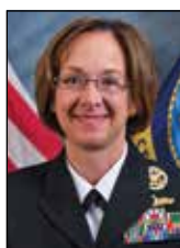
Lisa M. Franchetti Commander, Navy Region Korea/Commander, U.S. Naval Forces Korea/Commander, Naval Component, U.S. Forces Korea, U.N. Command, Korea (8/13)