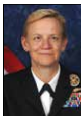
Nora W. Tyson Deputy Commander, U.S. Fleet Forces Command (7/13) 59