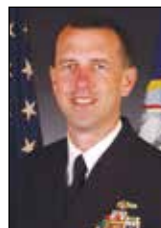
John M. Richardson Director, Naval Nuclear Propul- sion Program, Department of the Navy/Department of Energy (11/12) 9