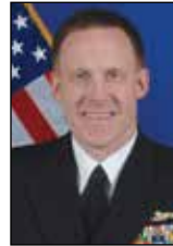
Michael S. Rogers Commander, Fleet Cyber Com- mand/Commander, 10th Fleet (9/11) Nom'd as: NSA/CSS/CYBER- COM 36