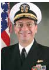
Charles W. Martoglio Deputy Commander, U.S. European Command (4/12) 42