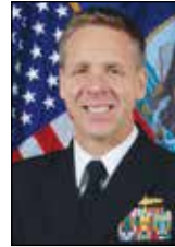
Philip S. Davidson Commander, U.S. 6th Fleet/Commander, Task Force Six/Commander, Striking and Support Forces NATO/Deputy Commander, NAVFAC-NAFAC (10/13) 66