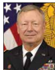
General Frank J. Grass National Guard Bureau