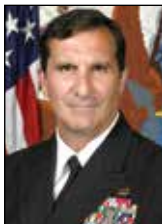
Frank A. Morneau Commander, Navy Expeditionary Combat Command (7/13) 168