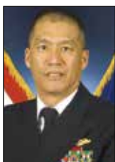
Colin G. Chinn Fleet Surgeon, U.S. Pacific Fleet/Command Surgeon, U.S. Pacific Command (8/13) 240