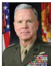
General James F. Amos U.S. Marine Corps