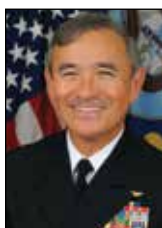
Harry B. Harris Jr. Commander, U.S. Pacific Fleet (10/13) 10