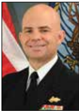
Louis V. Cariello Deputy Commander, Navy Expeditionary Combat Command/Deputy Com- mander, Navy Expeditionary Combat Command Pacific (6/13)