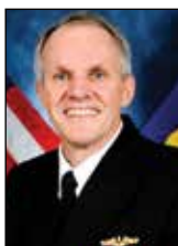
Phillip G. Sawyer Commander, Submarine Force, U.S. Pacific Fleet (7/13) 173