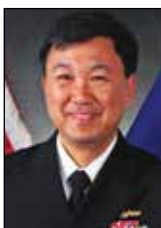
Jonathan A. Yuen Commander, Naval Supply Systems Command/Chief of Supply Corps (10/13) 147