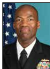
Kelvin N. Dixon Reserve Deputy Commander, U.S. Naval Forces, U.S. Central Command (6/12) 177