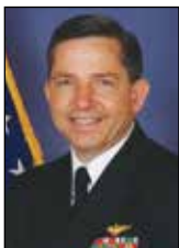
David A. Dunaway Commander, Naval Air Systems Command (9/12) 50