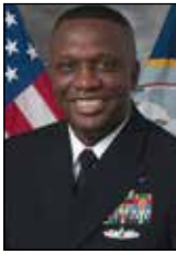
Charles Clarke Fleet Master Chief, U.S. Fleet Forces Command