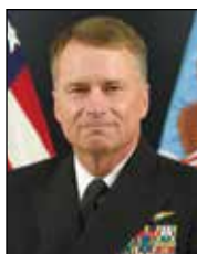
Admiral James A. Winnefeld Jr. U.S. Navy Vice Chairman