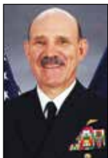
Bret C. Batchelder Commander, Joint Enabling Capabilities Command, U.S. Transportation Command (9/13) 330