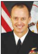
Troy M. Shoemaker Commander, Naval Air Force, U.S. Atlantic Fleet (6/13) 141