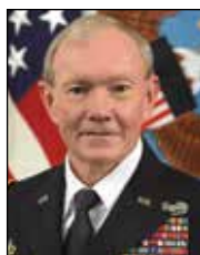
General Martin E. Dempsey U.S. Army Chairman