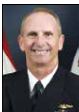
Jonathan W. Greenert Chief of Naval Operations (9/11) 2