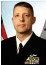
Wes Koshoffer Force Master Chief, Submarine Force, U.S. Atlantic Fleet