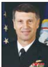
Bruce W. Clingan Commander, U.S. Navy Forces, Europe/Commander, U.S. Naval Forces, Africa/Com- mander, Allied Joint Forces Command, Naples (2/12) 7