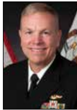
William D. French Commander, Navy Installations Command (2/12) 40