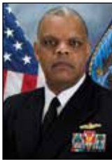
Sinclair M. Harris Commander, U.S. Naval Forces, U.S. Southern Com- mand/Commander, 4th Fleet (6/12) 146