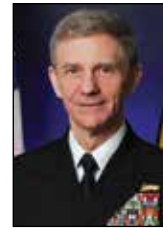
Philip H. Cullom Deputy Chief of Naval Opera- tions for Fleet Readiness and Logistics, N4, OPNAV (3/12) 41