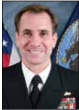
John F. Kirby Press Secretary, Office of the Secretary of Defense (12/13) 295