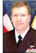
Mark L. Leavitt Commander, Naval Air Forces Reserve (9/13) ADDU: Deputy Commander, Naval Air Forces/Deputy Commander, Naval Air Forces, U.S. Pacific 263