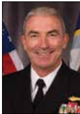
David G. Russell Reserve Component Deputy Commander, Navy Cyber Forces (10/10) 137