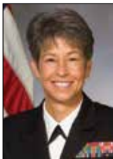
Nanette M. DeRenzi Judge Advocate General of the Navy (7/12) 45