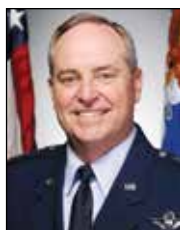
General Mark A. Welsh III U.S. Air Force