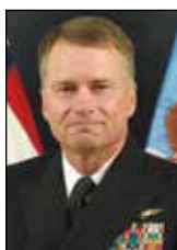
James A. Winnefeld Jr. Vice Chairman of the Joint Chiefs of Staff (8/11) 1