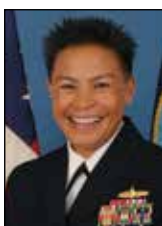
Babette Bolivar Commander, Navy Region Northwest (6/13) 376