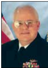
Joseph P. Mulloy Deputy Chief of Naval Operations for Integration of Capabilities and Resources, N8, Office of the Chief of Naval Operations (1/14) 68