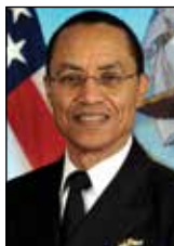
Cecil E. Haney Commander, U.S. Strategic Command (11/13) 5