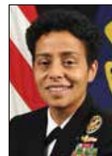
Michelle J. Howard Deputy Chief of Naval Opera- tions for Operations, Plans, and Strategy, N3/N5, OPNAV (8/13) Ord'd as: Vice Chief of Naval Operations (EDA 3/14) 48