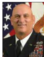
General Raymond T. Odierno U.S. Army