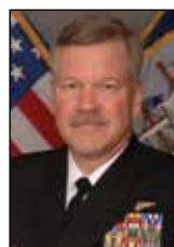
Mark I. Fox Deputy Commander, U.S. Central Command (8/13) 25