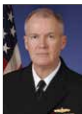
Donald L. Singleton Deputy Chief of Staff for Logistics, Fleet Supply and Ordnance, N4, COMPACFLT (7/12) 368