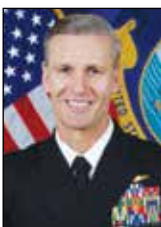
Joseph P. Aucoin Deputy Chief of Naval Operations for Warfare Systems, N9, OPNAV (5/13) 54