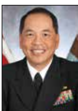
Peter A. Gumataotao Commander, Naval Surface Force, Atlantic (8/13) 160