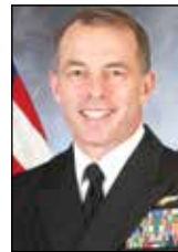
Terry B. Kraft Commander, U.S. Naval Forces, Japan/Commander, Navy Region Japan (8/13) 125