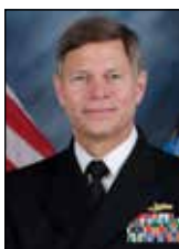
James T. Loeblein Deputy Commander, U.S. Naval Forces, U.S. Central Command (8/13) 358