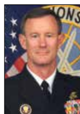
William H. McRaven Commander, U.S. Special Operations Command (8/11) 3