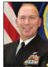
Jon Port Force Master Chief, Naval Education and Training Command