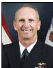
Admiral Jonathan W. Greenert U.S. Navy