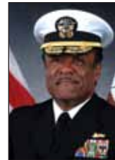
Derwood C. Curtis Commander, Naval Surface Forces/Commander Naval Sur- face Force, U.S. Pacific Fleet (3/08) 24