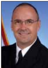
Clinton F. Faison III Commander, Navy Medicine West/Commander, Naval Medical Center, San Diego, CA (8/10) 363