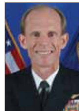
James D. Cloyd Commander, Task Force Seven Zero/Commander, Carrier Strike Group Five (5/10) Nom'd as: Commander, Navy Region Japan/Commander, U.S. Naval Forces, Japan/Com- mander, Naval Component, U.S. Forces Japan, Yokosuka, Japan 264