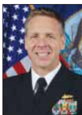
Philip S. Davidson Senior Military Advisor to the U.S. Special Representative for Afghanistan and Pakistan (12/10) 255