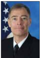
Frederick J. Roegge Deputy Commander, Joint Functional Component Command for Global Strike, U.S. Strategic Command (9/10) 388