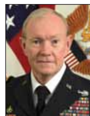
General Martin E. Dempsey U.S. Army