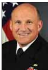
Michael M. Gilday Director of Operations, Joint Forces Command Lisbon (8/10)