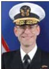
Douglass T. Biesel Commander Navy Region Northwest (6/10) 269