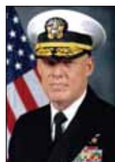
Sean A. Pybus Commander, Special Opera- tions Command, U.S. Pacific Command (6/09) Ord'd as: Commander, Naval Special Warfare Command, San Diego, CA (EDA: 7/11) 261