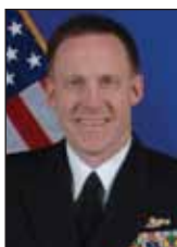
Michael S. Rogers Director for Intelligence, J2, Joint Staff (9/09) 194