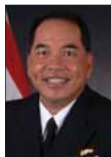
Peter A. Gumataotao Commander, Navy Region Korea/Commander, U.S. Naval Forces Korea/Commander, Naval Component, U.S. Forces Korea, United Nations Command, Korea (9/09) Nom'd as: Commander, Carrier Strike Group Eleven, San Diego, CA 337