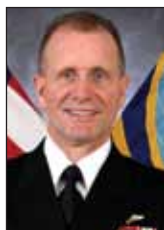
Scott T. Craig Deputy Chief of Staff for Capabilities and Resource Integration, N8, U.S. Fleet Forces Command (9/09) 338