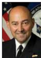
James G. Stavridis Supreme Allied Commander, Europe/Commander, U.S. European Command (6/09) 3