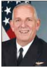
David Architzel Commander, Naval Air Sys- tems Command (5/10) 19