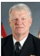
Gary Roughead Chief of Naval Operations (9/07) 2