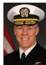
Donald P. Quinn Commander, Navy Personnel Command/Deputy Chief of Naval Personnel (3/09) Nom'd as: Commander, Naval Education and Training Com- mand, Pensacola, FL 145