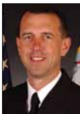
John M. Richardson Commander, Naval Submarine Forces/Commander, Submarine Force, U.S. Atlantic Fleet/Commander, Allied Submarine Command (11/10) 56