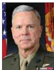
General James F. Amos U.S. Marine Corps