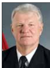
Admiral Gary Roughead U.S. Navy