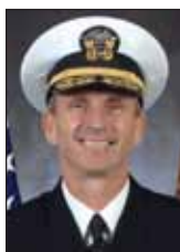
Jonathan W. Greenert Vice Chief of Naval Operations (8/09) 7