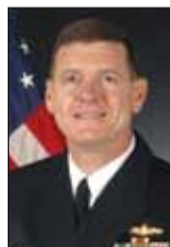
Luke M. McCollum Commanding Officer, U.S. Fleet Forces Command Joint Task Force Unit 300 (12/09)