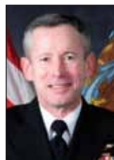
Ted N. Branch Commander, Naval Air Force, U.S. Atlantic Fleet (2/11) 200