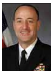
Jeffrey Harbeson Commander, Joint Task Force Guantanamo, U.S. Southern Command (6/10) 352