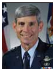
General Norton A. Schwartz U.S. Air Force