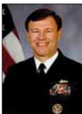
James W. Houck Judge Advocate General of the Navy (8/09) 42