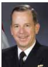
Michael G. Mullen Chairman of the Joint Chiefs of Staff (10/07) 1