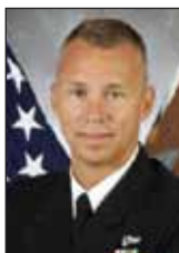
Kirk Saunders Force Master Chief, Submarine Force, U.S. Atlantic Fleet