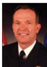
John E. Jolliffe Reserve Deputy Commander, U.S. Naval Forces, U.S. Central Command (2/10) 345