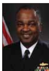
Charles K. Carodine Deputy Commander, Naval Warfare Development Command (2/10) 348