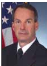
Lothrop S. Little Commander, Navy Reserve Forces Command (2/10) 195