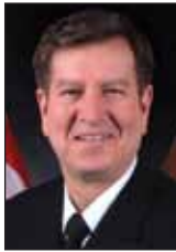
Allen G. Myers IV Commander, Naval Air Forces/Commander, Naval Air Force, U.S. Pacific Fleet (7/10) 47