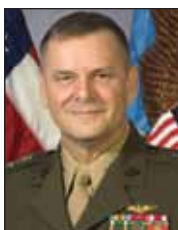
General James E. Cartwright U.S. Marine Corps Vice Chairman