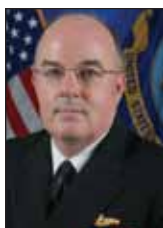
John C. Harvey Jr. Commander, U.S. Fleet Forces Command (7/09) 10