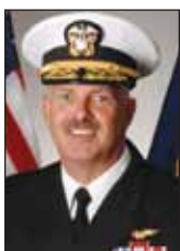
Joseph F. Kilkenny Commander, Naval Education and Training Command (8/09) 88