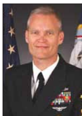
Bradley N. LeVaul Fleet Master Chief, U.S. Naval Forces Europe/ Africa