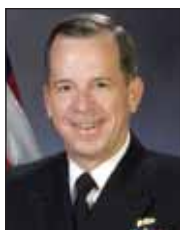
Admiral Michael G. Mullen U.S. Navy Chairman