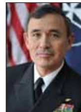
Harry B. Harris Jr. Commander, Sixth Fleet/Com- mander, Striking and Support Forces NATO/Deputy Com- mander, U.S. Naval Forces Africa/Joint Force Maritime Component Commander Europe (11/09) 27