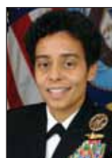
Michelle J. Howard Chief of Staff, J5, Joint Staff (8/10) 182