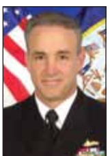
Charles M. Gaoquette Deputy Commander, U.S. Naval Forces, U.S. Central Command, Bahrain (5/10)