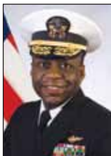
Earl L. Gay Commander, Expeditionary Strike Group Three/Com- mander Amphibious Group Three (7/09) 241