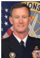
William H. McRaven Commander, Joint Special Operations Command/Com- mander, Joint Special Opera- tions Command Forward, U.S. Special Operations Command (6/08) 26