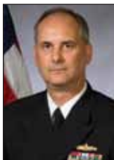
Richard B. Landolt Commander, Expeditionary Strike Group Seven/Com- mander, Amphibious Force U.S. Seventh Fleet (6/08) 258