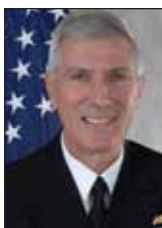
Samuel J. Locklear III Commander, U.S. Naval Forces, Europe/Commander, U.S. Naval Forces, Africa/Com- mander, Allied Joint Forces Command, Naples (10/10) 11