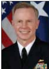
Charles J. Leidig Deputy for Military Operations, U.S. Africa Command (8/10) 50