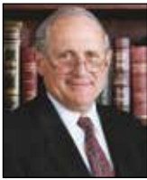
Carl Levin (D-MI) Chairman