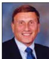
Bill Shuster (R-PA) Chairman