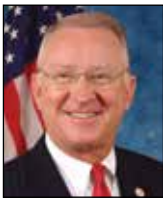
Howard "Buck" McKeon (R-CA) Chairman