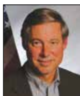
Fred Upton (R-MI) Chairman