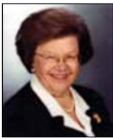
Barbara A. Mikulski (D-MD) Chairman