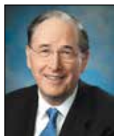
John D. Rockefeller IV (D-WV) Chairman