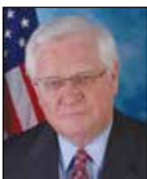
Harold Rogers (R-KY) Chairman