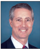
Mac Thornberry (R-TX) Chairman