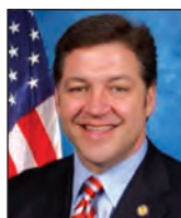
Bill Shuster (R-PA) Chairman