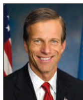
John Thune (R-SD) Chairman