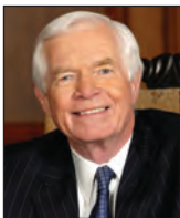
Thad Cochran (R-MS) Chairman