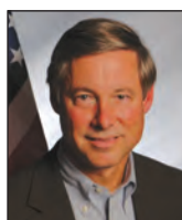
Fred Upton (R-MI) Chairman