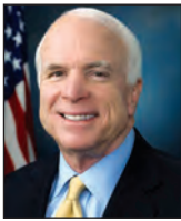
John McCain (R-AZ) Chairman