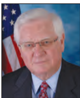
Harold Rogers (R-KY) Chairman