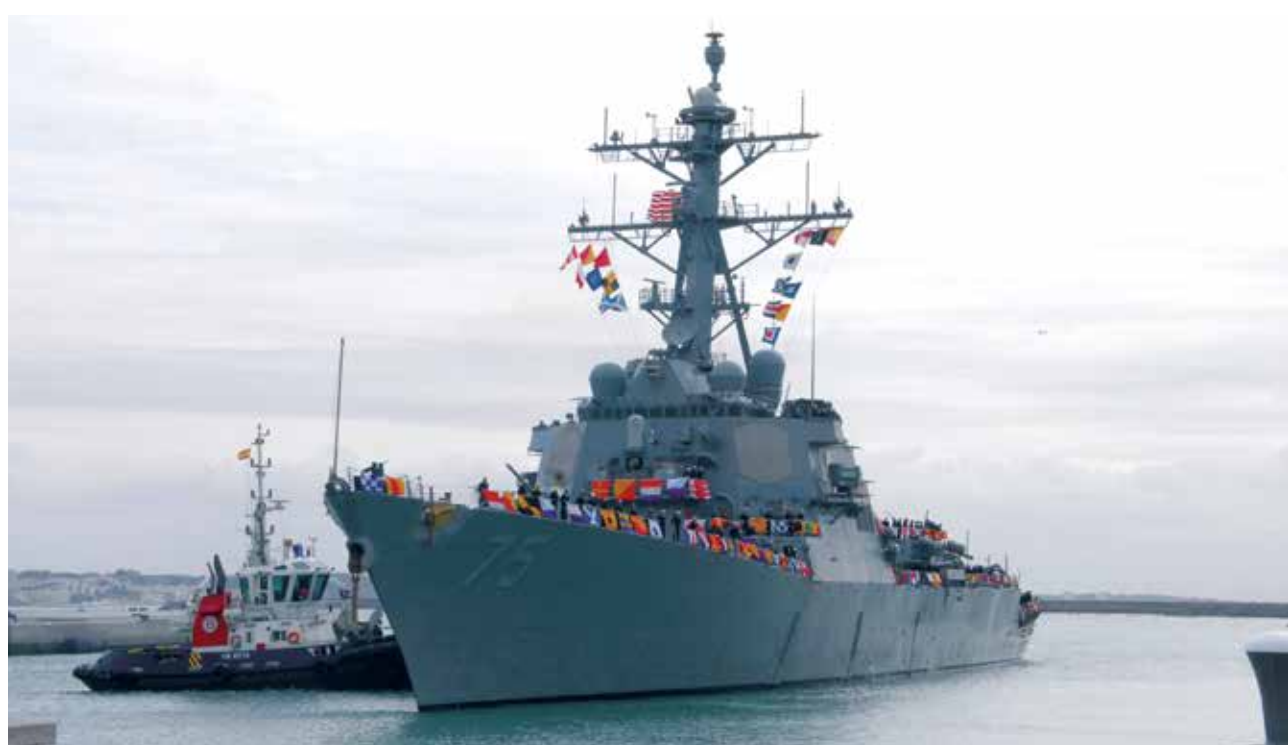
The guided-missile destroyer USS Donald Cook (DDG-75) arrives at Naval Station Rota, Spain, on 11 February. The Donald Cook is the first of four Arleigh Burke -class vessels to be forward deployed to Rota starting in 2014.